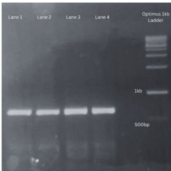
Figure (Competition comparison)

(Lane 1: iScript, Biorad), (Lane 2: Verso, Thermo), Lane 3: TAKARA, cDNA Kit), (Lane 4: DX/DT 5X Mastermix and Optimus™ 1kb marker),